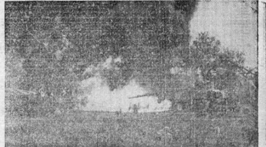
Tanque de la infantería de marina de los Estados Unidos, provisto de un lanzallamas, ataca una posición japonesa en la isla de Saipán, en el Pacífico. A pesar de la encarnizada resistencia enemiga la estratégica isla fué totalmente ocupada en 25 días de combate.