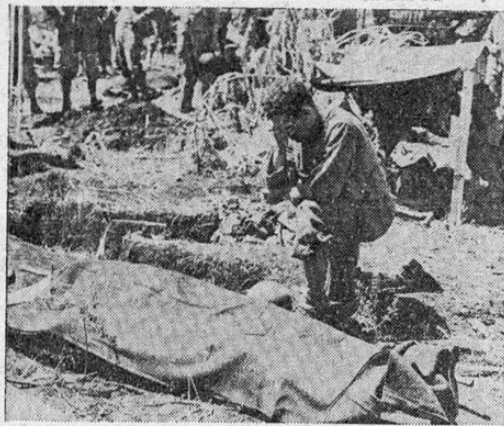
Agobiado por el dolor un soldado de infantería de marina de los Estados Unidos inclina la cabeza arrodillado junto al cadáver de un compañero de armas muerto en acción contra los japoneses en la isla de Saipán, en el Pacífico.